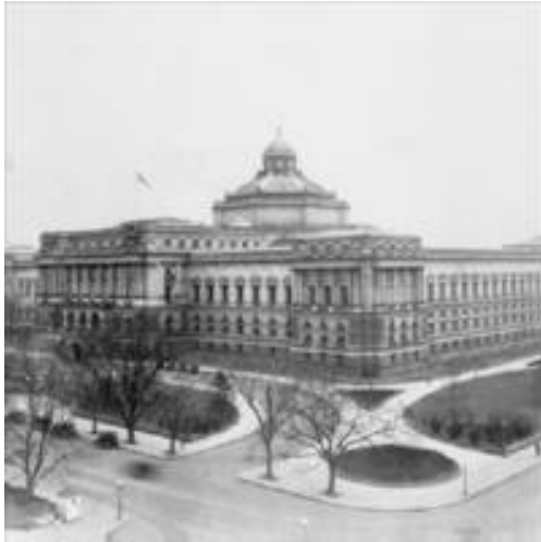
A view of the completed Jefferson Building