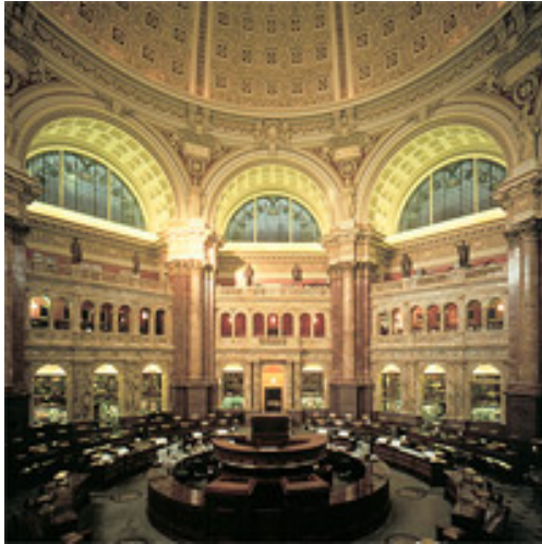
The Main Reading Room in the Library of Congress, 1997