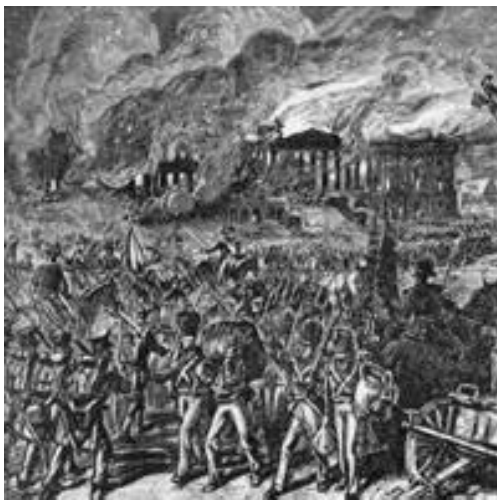
A drawing of the "Capture and burning of Washington by the British, in 1814"